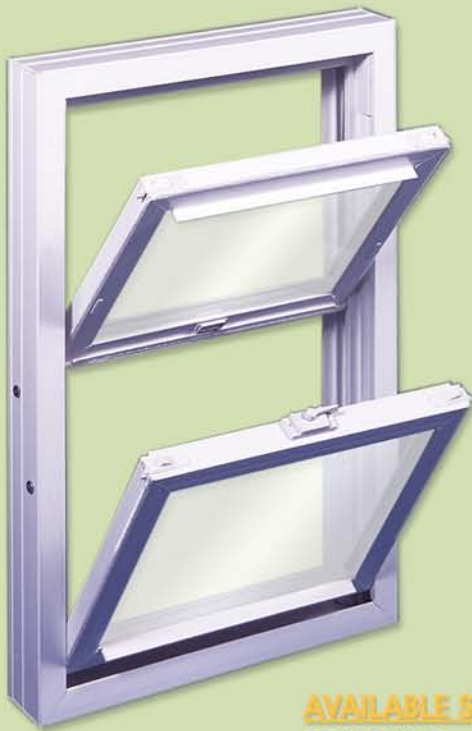
AVAILABLE STYLE: DOUBLE HUNG