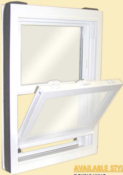
AVAILABLE STYLE: DOUBLE HUNG